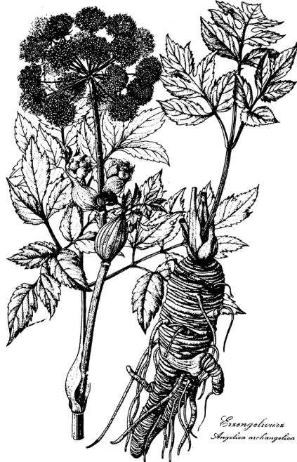
Erangelicorum Angelica archangelica